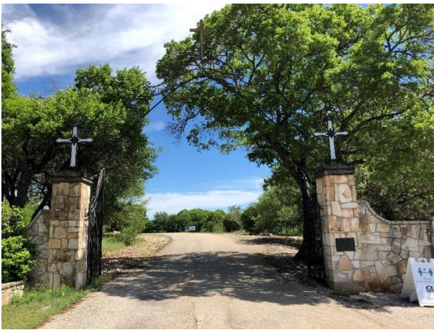
Entrance to Mo Ranch during the Men's Conference