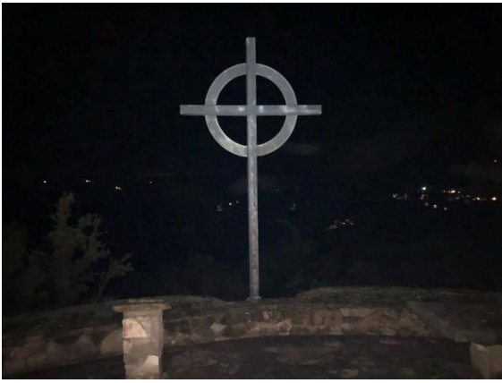
New cross on the Chapel on the Hill at Mo Ranch.