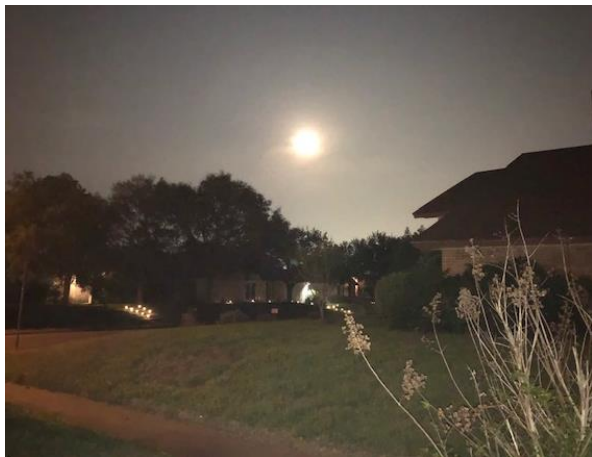
A large full moon over the church last month; the beauty of creation is evident even at night.